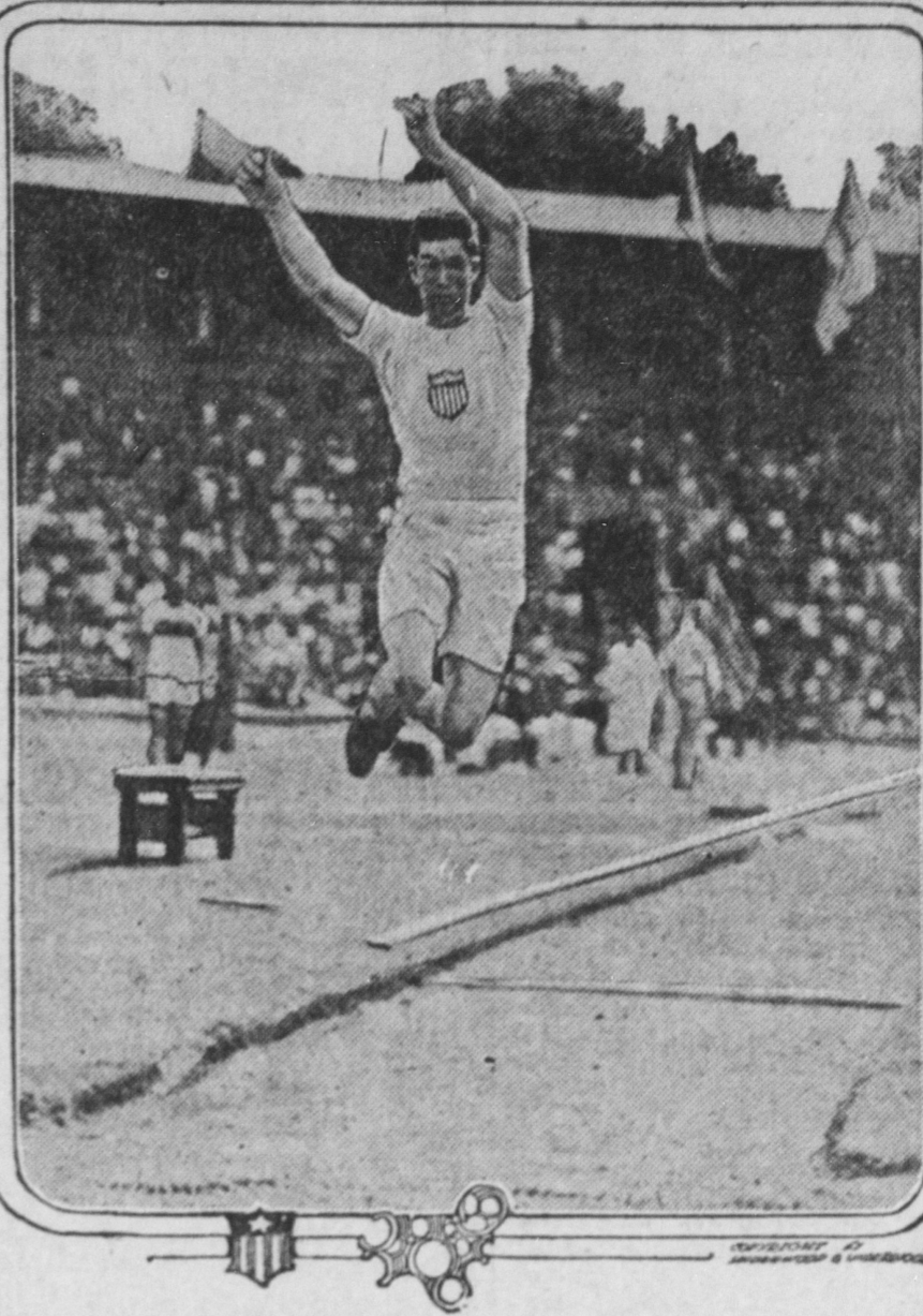
Jim Thorpe, Peerless Athlete.

Why do American athletes eclipse all others? The question is raised chiefly in Europe, where so many of our laurels are won. It does not bother us very much over here, for what we are chiefly concerned with is winning. As pragmatists, we believe that the test of the pudding is in the eating, we simply dismiss the matter by concluding that as we win most of the contests we must be the best athletes and accept that as the answer.