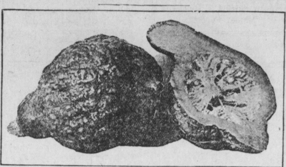
Fine Hubbard Squash.

(By BESSIE L. PUTNAM.) Save your squash seeds from the first really good Hubbard that matures. Like begets like, and if you wait until the late ones are ripe, you simply make a selection that will produce a later fruit another year.