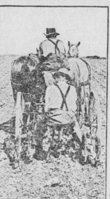
Cultivator For Use on Plants Placed Close Together in Row. The Man in Rear Manipulates One Set of Gangs With Feet and One With Hands.

(By BESSIE L. PUTNAM.) Save your squash seeds from the first really good Hubbard that matures. Like begets like, and if you wait until the late ones are ripe, you simply make a selection that will produce a later fruit another year.