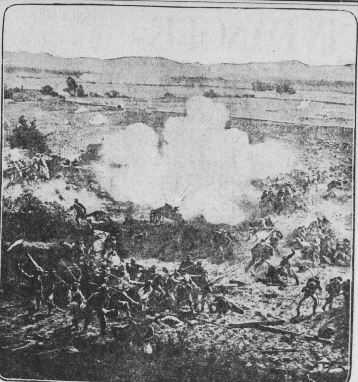
Explosion of an ammunition caisson during the Battle of Gettysburg, by which a number of soldiers of the Twenty-eighth Infantry were killed.

Spanish Olives Every one from Seville, long famed as the home of the world's best olives. Only the pick of the crops is offered to you under the Libby label. Either the Queen or Manzanilla variety or Pimento Stuffed. Insist on Libby's. Libby, McNeill & Libby Chicago