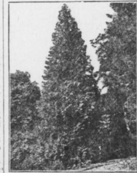
A Beautiful Specimen.

In a visit to England a few years ago, I saw a plantation of Thuya and larch planted in poor clay over chalk, and the Thuya had completely outstepped the larch. Another instance,