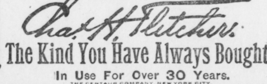
In Use For Over 30 Years.