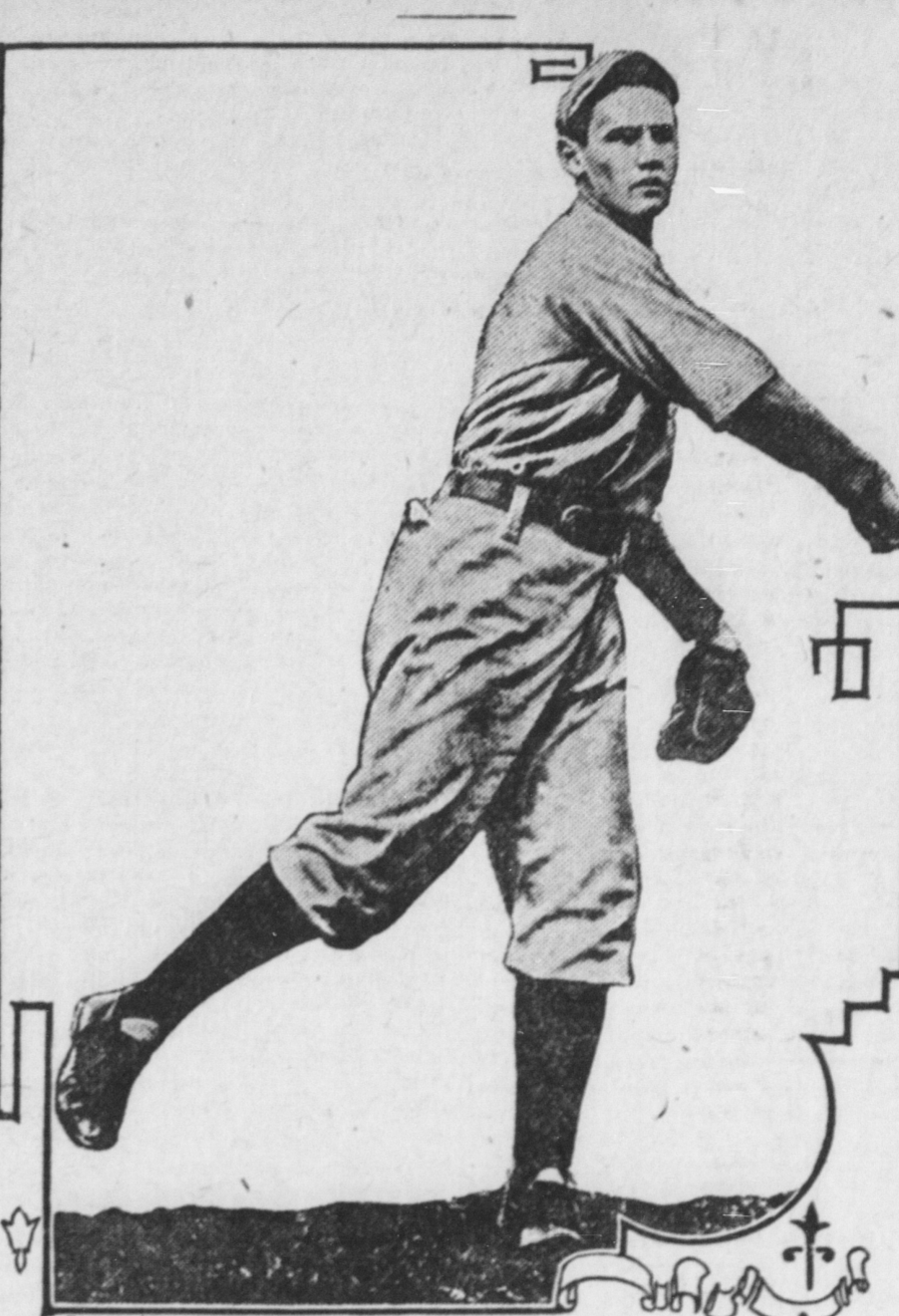
Joe Wood, Idol of Boston Fans.

Fans may sing the praises of Ed Walsh, Walter Johnson, Christy Mathewson, Rube Marquard and other pitchers, but down Boston way New Englanders are taking off their lids to one Joe Wood.