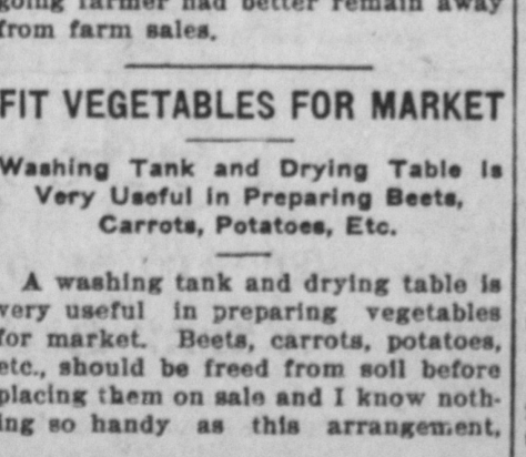
Washing Tank and Drying Table.

writes Mrs. H. O. McPherson in the Farm and Home. The table, b, is hinged to the tank a. The legs are also hinged, and when not in use are folded over on the table and the table folded over so as to form a lid for the tank, the legs folding inside, out of the way. The bottom of the tank should be lower at one corner with a hole to let out the water after using, by withdrawing a plug or stop-