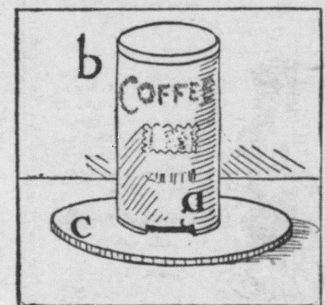
For Baby Chicks.

With a can opener I cut a slit about two inches long, close to the bottom | eggs will bring. of the can, then at each end of the