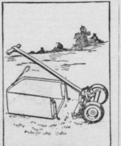
Handy Grass Catcher.

A rake will be unnecessary to the man who mows grass with the device shown here attached to the back of the mower. This is the invention of a Minnesota genius, and it is said to leave a clean sward in the wake of the lawn mower, catching the loose grass that flies up in the rear before it has a chance to fall again. The apparatus is made with a galvanized steel bottom and heavy duck sides and is easily detached and emptied when it becomes full. Two hooks are fastened at the ends of the roller of the mower and circular wire pieces fit