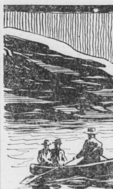
Drove the Dory Swiftly Toward the Echo.

Coast glanced at Katherine; she wore a face of doubt mirroring his own perplexity, but when she caught his eye upon her, responded with a nod and a shrug.