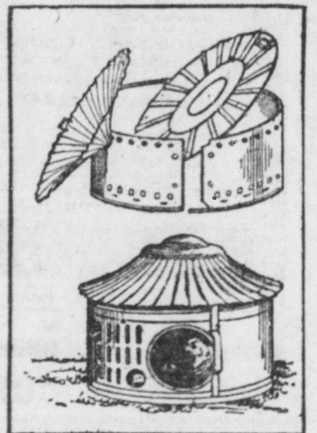
Coop for Little Chicks.

A coop that provides a safe and sanitary home for young chickens has been invented by an Illinois man. It is made of galvanized iron, with a circular body and a peaked roof, with over-hanging eaves. It is rain, rat