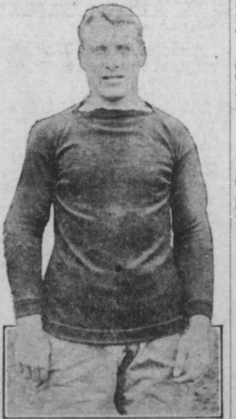
Leader of Wisconsin Football Team.