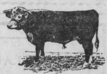
A Fine Hereford Steer.

Hereford, Shown in Illustration, Weighed 1,470 Pounds When Only Two-Year-Old.