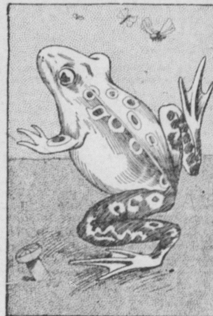
THE OLDEST FROG.

There was once a grand contest announced for all the young frogs in Marsh's pond. The oldest bullfrog was coming to decide the matter. Young Peter Frog had always been good from the time he was a polliwog, and he made up his mind to win the prize and wear the medal. For weeks the other frogs were practicing diving off a log, and it was very much the way they had always played before the contest was announced. Peter Frog refused to join them. He carried a toadstool for an umbrella, so afraid was he that a