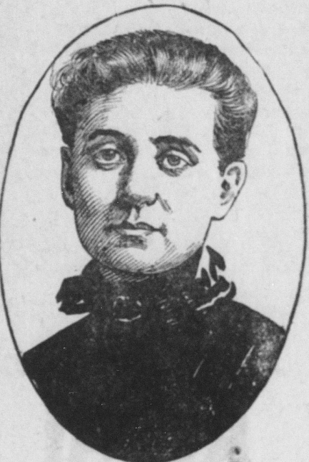
MISS JANE ADDAMS.

After graduation from a western college—Miss Addams is a native of Illinois—she traveled in Europe with her