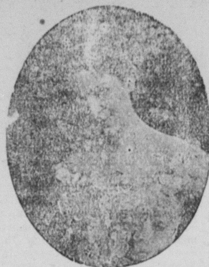
Novelties at Keith's.

You can buy a first-class blanket at a low price from Boxer, Centre Hall.