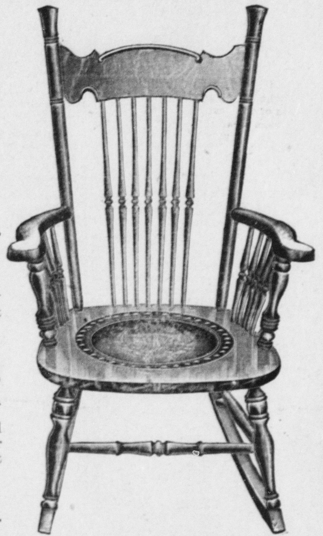
COBLER SEAT ROCKER.