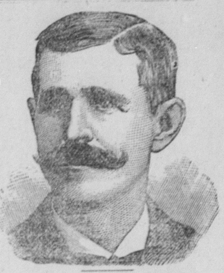
A STRANGE CASE.

WANTED RELIABLE MEN to sellour choice and complete line of Nursery Stock. Highest salary and commission paid weekly, paying and permanent position guaranteed and success insured to good men. Special inducements to beginners, experience not necessary. Exclusive letritory and your own choice of same given. Do not delay. Apply to ALLEN NURSERY CO. mar7-4m Rochester, N. Y.