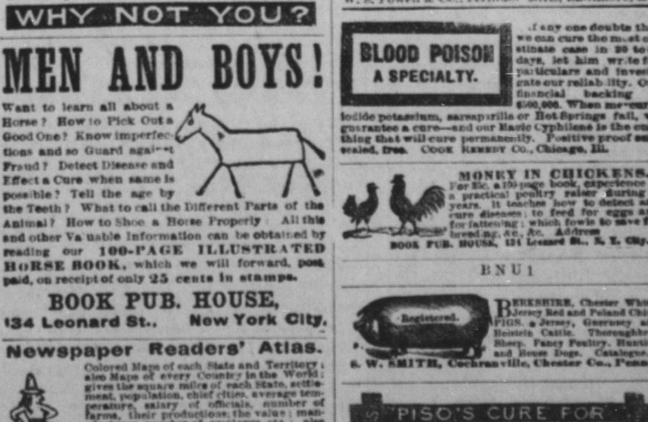
meat, population, oner third, verager persitive, sality of officials, number farms, likely productions, the value; ma ufactures, number of employee, cf. all area of each Fereign Constiry, form of trade, religion, size of army and to reach, religion, size of army and the reach, religion, size of army and the FIERV YANIA' SHOULD HAVE ONE FUERV YANIA' SHOULD HAVE ONE DOCK FUE, HOUSE, 194 Lessard St. S. Y. Chy ES WHERE ALL ELSE FAILS. One bottle for fifteen cents, by mail. Twelve bottles for one dollar, ·P·A