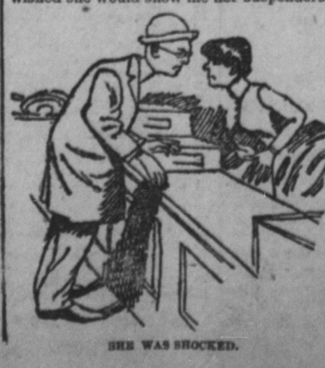
she was shocked.

Those were my exact words, and yet the papers the next day not only gave a garbled and erroneous account of it, but misspelled my name twice. Thus it came to pass that the only time I ever tried to buy any thing in New York, when I had the money to do it with, I met with a rebuke that I can not yet fully understand.