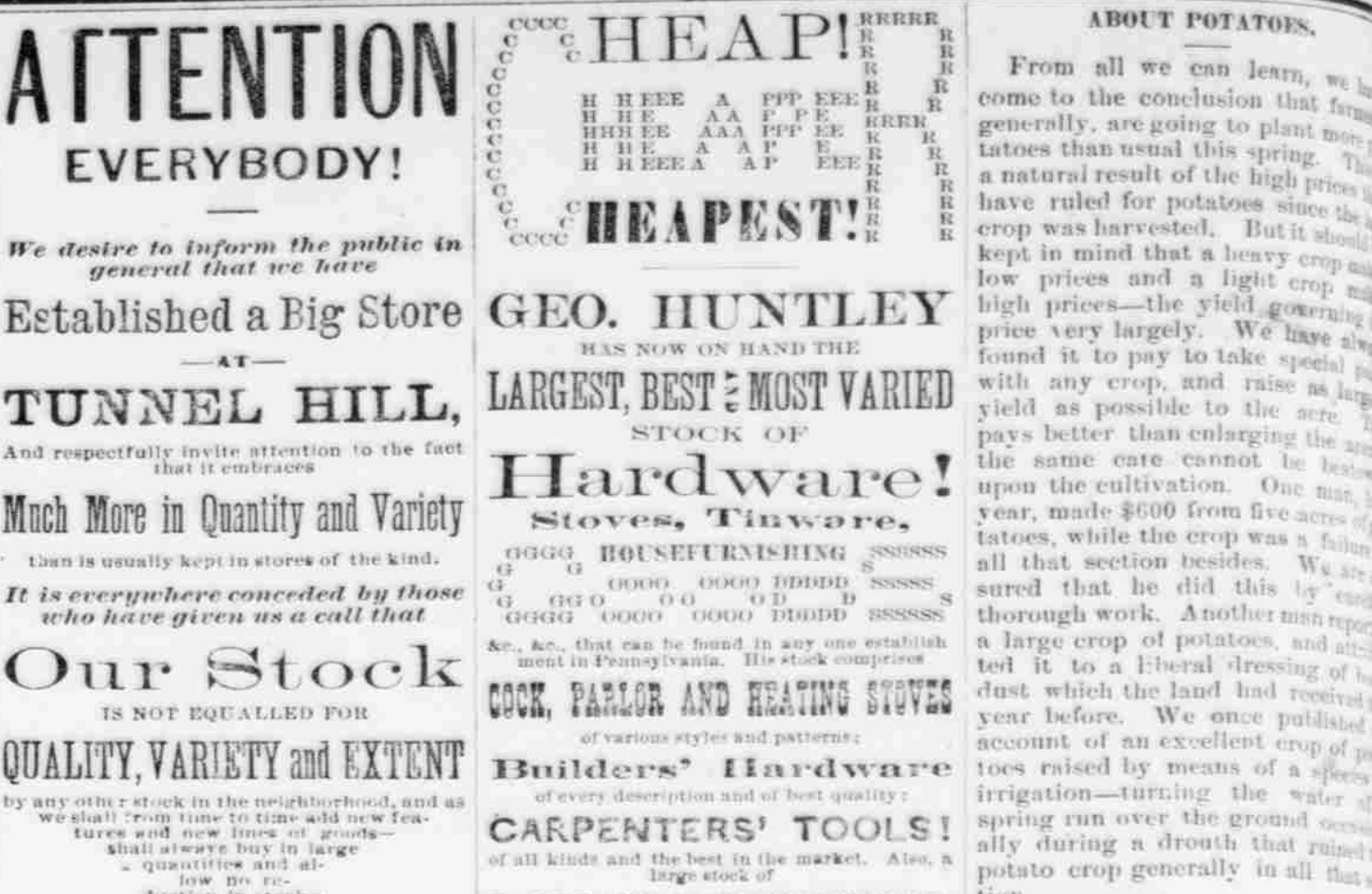
TABLE AND POCKET CUTLERY. Glassware, Greensware, Silver-Flated Ware, Wood and Willow Mare, Wall Pa-per, Franka and Sallers, Berdivers, An-tife, Vires, Horneshaet, Barlerin, Kall Red, Einree Salls, Gertage Bolls, Riv-ets, Millanna, Grindatanes, Steelshovel Piew Houlds, Road become;

Mowing Machines, Horse Hay Rakes, Horse Hay Forks, Rope and Pulleys, Corn Unitivators, and stall line of Harv-esting Tools. Also, a large according to