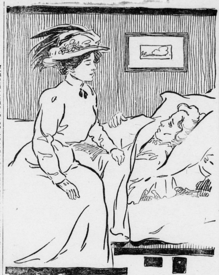
ard a Sad and Pitiful Narrative."

But I had only located the hidden room. I was not in it, and no amount of pressing on the carving of the wooden mantels, no search of the floors' for loose boards, none of the customary methods availed at all.