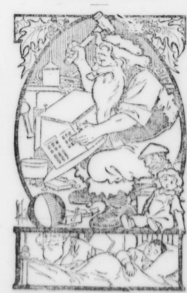
And the jolliest and best old work-