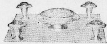
SET OF FLOWER HOLDERS FOR THE TABLE.

Red is the Christmas color, and the more vivid a table is the more appropriate. Formerly the tone was given by holly and red ribbon, but lately the poinsettia has superseded everything.