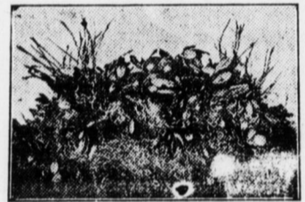
CENTERPIECE OF HOLLY, MOSS AND ORANGES.

For a place card use a poinsettia blossom, with a tiny doll head set in the cup of flowers. Should one not wish to use the poinsettia plants as favors the small red sleds filled with candy