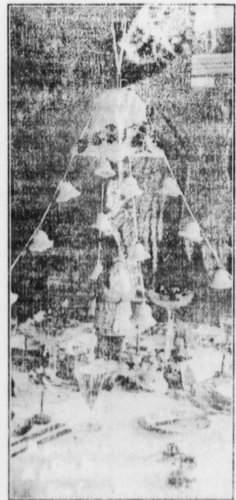
THE SANTA CLAUS TABLE.

Here is a table that can be arranged with but little trouble and expense. The centerpiece consists of a toy figure of old Santa Claus standing on a mound of snow made from cotton batting. On this mound are placed little Christmas favors done in tissue paper and sealed with Christmas seals. A wreath of holly surrounds the centerpiece. The place cards are bells, and the nut dishes are made from pink and green tissue paper, while a row of tiny candles surrounds the center of the mound. A large Christmas bell