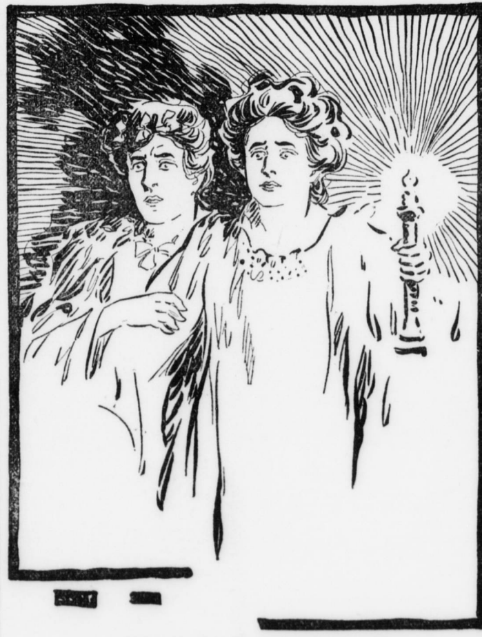
That Completed Our Demoralization.

The house was a typical summer residence on an extensive scale. Wherever possible, on the first floor, the architect had done away with partitions, using arches and columns instead. The effect was cool and spacious, but scarcely cozy. As Liddy and I went from one window to another, our voices echoed back at us uncomfortably. There was plenty of light—the electric plant down in the village supplied us—but there were long vistas of polished floor, and mirrors which reflected us from unexpected