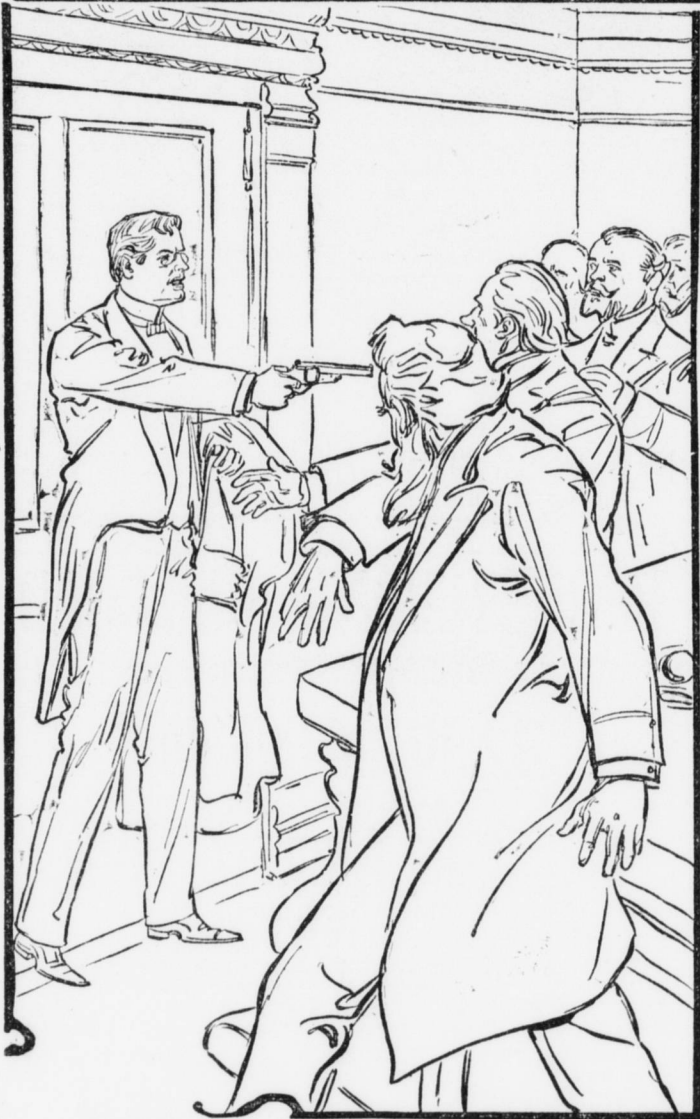
He Suddenly Whipped the Pistol from His Pocket.

hind him flew open, and a half a dozen nihilists were vomited forth. Several of them were armed, and, pointing pistols at Hardy, they shrieked: