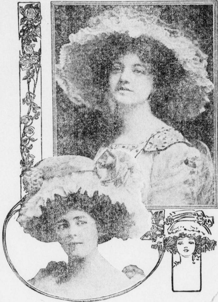
BY JULIA BOTTOMLEY.

T WO lovely hats are shown here made of val lace such as is so much used on lingerie frocks and fine undergarments. Since val lace invaded the realm of millinery a few seasons ago as a material of which hats are made the "lingerie hat," as it is called, has become a staple, just as felt or velvet are, and have been for generations. Each season now sees the introduction of new developments in lace hats. These lingerie hats are for winter and summer alike, just as the pretty frocks are of mill or batiste or light wash silks, trimmed with val lace. One sees them trimmed with fur and feathers, or with velvet or silk flowers for winter, and decorated with distinctly summer flowers for wear in the hottest weather. The lace is washable and lives many seasons when used in millinery.