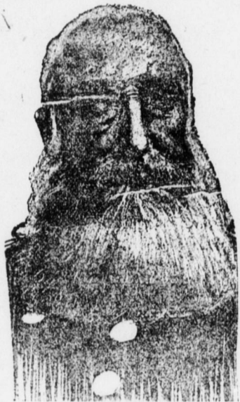
Leopold of Belgium.

King Leopold's recent illness dated from about two weeks ago, when he was compelled to take to his bed, suffering from rheumatism. It was thought at the time that he had a stroke of apoplexy, for he was paralyzed on one side and the paralysis seemingly spread over the entire body. His confinement brought about intestinal obstruction, for which an operation had been performed.