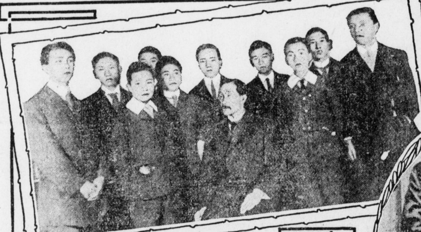
CHINESE STUDENTS AT CHRISTMAS REUNION AT CHINESE LEGATION

are purchased and stored temporarily in the embassies are not all for the adults and children of the household. The probable visitors of the day are borne in mind and as a little Brazilian boy in Washington put it once: "I have had ten Christmases in ten hours."