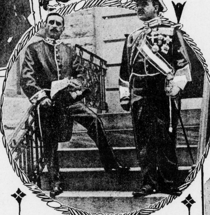
SPANISH MINISTER AND SECRETARY STARTING ON ROUND OF CALLS

The races that come to the melting pot of America keep their home Christmas for only a few years after they arrive. Then they drift off into a more or less Americanized Christmas. For a few years after they come, also, they try to eat their traditional dishes at Christmas time. The Hungarian housewife makes the Christmas cakes which a long line of ancestral cooks made before her across seas. They are round balls of dough, covered with honey and poppy seed, and then baked. The Bohemians and Poles also make poppy seed cakes, each in a different style. The Sicilian housewife, too, has a traditional Christmas cake. It is a ring of dough with a hole in the middle—the Italian doughnut, in fact—which is fried, sprinkled with sugar and eaten hot.