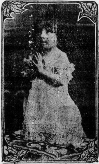
The Christmas Prayer.

IS'T not enough that on this Christmas morn, This glad birth morn of him whose day it is, My heart, but yesterday so sad, forlorn, Doth open to the message that was his? Is't not enough to know that from above The tidings of a sacrifice divine Come as a gift of an eternal love That I have but to take to make it mine?