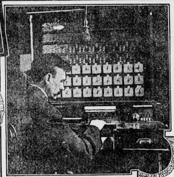
THE OLD STYLE TABULATOR WITH DIALS THAT REQUIRED TO BE RESET BY HAND

The great army of house-to-house canvassers who will count you and your family in 1910 are not as yet even estimated by Director North, but it is recorded that one man counts only about 10,000 persons, many of them counting less in the small space of time allotted to the tabulation. Thousands upon thousands of extra men will