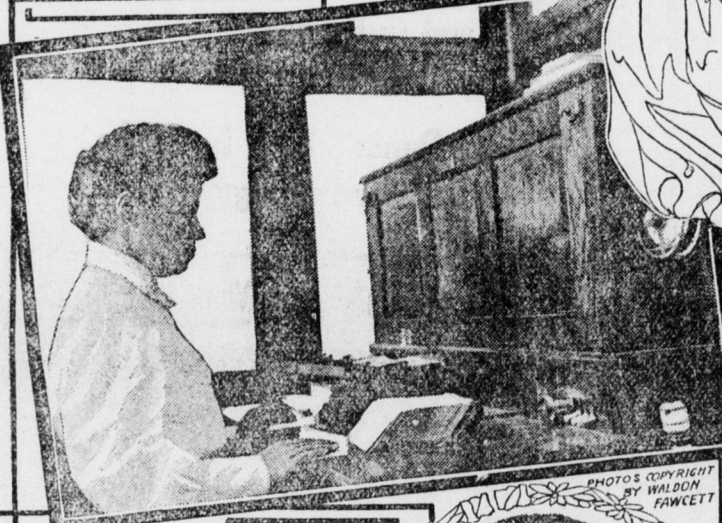
THE NEWLY-PERFECTED TABULATING MACHINE

Lawmakers much regret that whereas the constitution of the United States requires that each ten years there be a