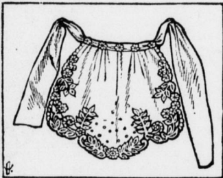
APRON IN BRABANT LACE.

A stocking bag is by no means a new idea, but it is so practical and useful that it always makes an acceptable