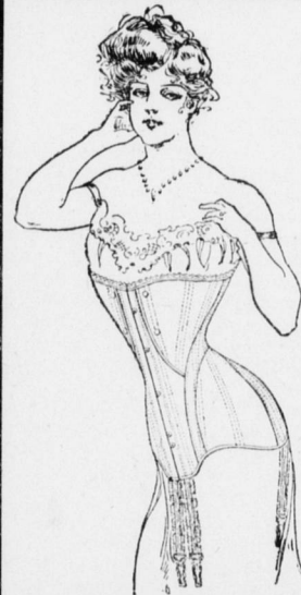
AMERICAN BEAUTY Style 502 Kalamazoo Corset Co., Makers

These corsets meet every requirement and are made in models to suit every purse and figure. Price 50c to $3.00.