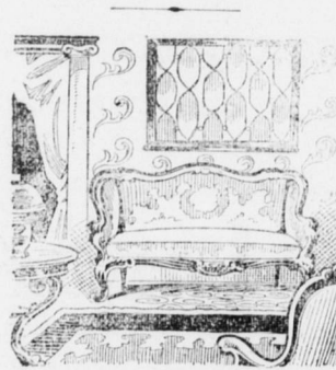
THAT DEN OF YOURS

is possibly lacking in some article that we can furnish to make it more comfortable and artistic. It is fully furnished, do you think? Would not a Desk, Side-Table or Chair add to its usefullness and completene? We have a full and varied assortment of all kinds of furniture that is suitable for the men's den. Pictures. Book-Cases, Lounging Chairs, etc., or rugs of fine weave and fancy design. We can supply anything that you are short of at moderate prices.