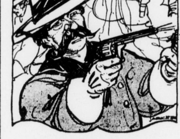
IT WAS THEN BEGUN THE SHOOTIN'.

'Lowed he'd sell that set at auction, and he says, "New, boys, you bet This'll make a hit with teacher—this here swell new toilet set."