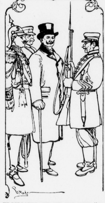
HER BELLOWED OUT THE ONE WORD 'MAJESTAE!'

The kaiser does no shopping himself, but he is the greatest Christmas box giver of all.