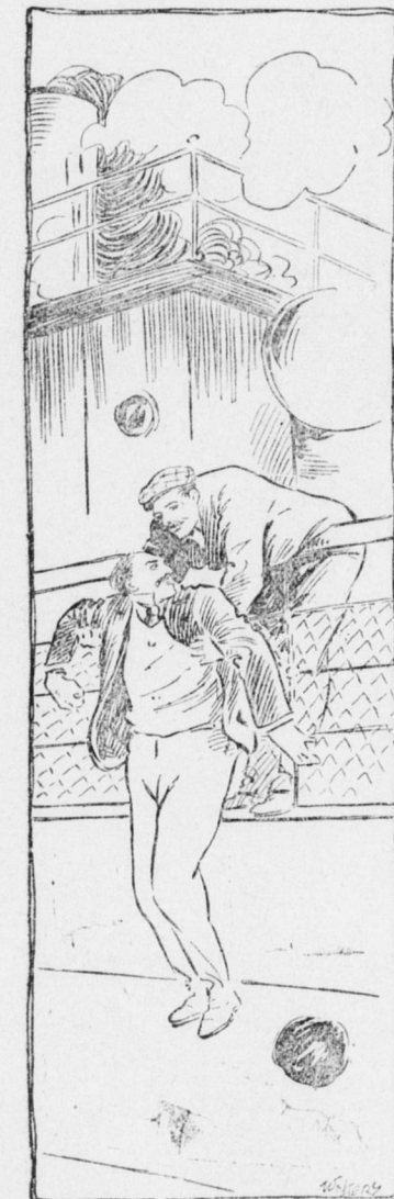
Suddenly... the Maniac Lifted Dr. Smith Bodily in the Air, and Held Him Over the Ship's Side.

Then ensued a frightful struggle. Realizing the awful peril which menaced him, the doctor struggled with despairing energy to bring his assailant to the deck, but in vain. He was like a child in the man's grasp.