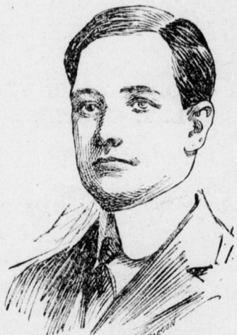
JOSEPH M. PATTERSON. (Millionaire Socialist Who Is Studying to Be a Farmer.)

Few of the latter, however, really know who he is because of the short time he has been at the university.