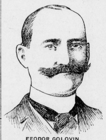
FEODOR GOLOVIN. (He Has Been Elected President of the New Russian Douma.)

St. Petersburg — Feodor Golovin, who was elected speaker of Russia's new douma, or lower house of parliament, when that body met and organized in the Tauride palace, St. Petersburg, recently, is a man of great energy, and throughout the long-continued reign of turbulence has managed to hold the confidence of the people. He is a constitutional democrat and, although this faction has only 100 members, Golovin received 331 votes, against 91 for the conservative candidate, the socialists throwing their strength for Golovin. The new speaker represents the Moscow province.