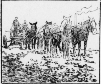
Slag Foundation and Broken stone Surface.

Our two illustrations taken from the New York Times show how hundreds of miles of roadway in the rural