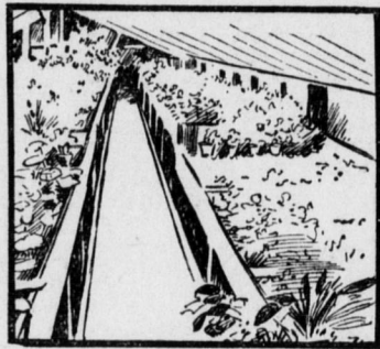
Interior of Greenhouse.

This greenhouse is perhaps larger than most gardeners would need, being 60x80 feet, says a correspondent of Orange Judd Farmer. The main entrance is from the south, there being two walks two and one-half feet wide, each extending the length of the house. At the north end of the walk is a door and window opening into the furnace room. This window furnishes all the air for the furnace room during cold weather. This furnace room is 7x18 feet and has an outside door. The pipes extend through the house from the furnace under the center bench and back again to the boiler. The center bench is six feet wide and two side benches each three and one-half feet wide.