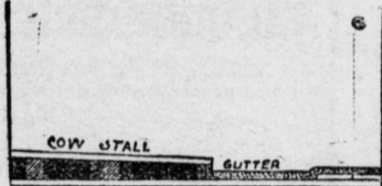
Plan of Cow Stall.

After much experience, the writer considers the plan for a cow stall, shown in the cut, as one of the best that can be used, says a correspondent of Farm Journal. The cow stands on planks that are matched and