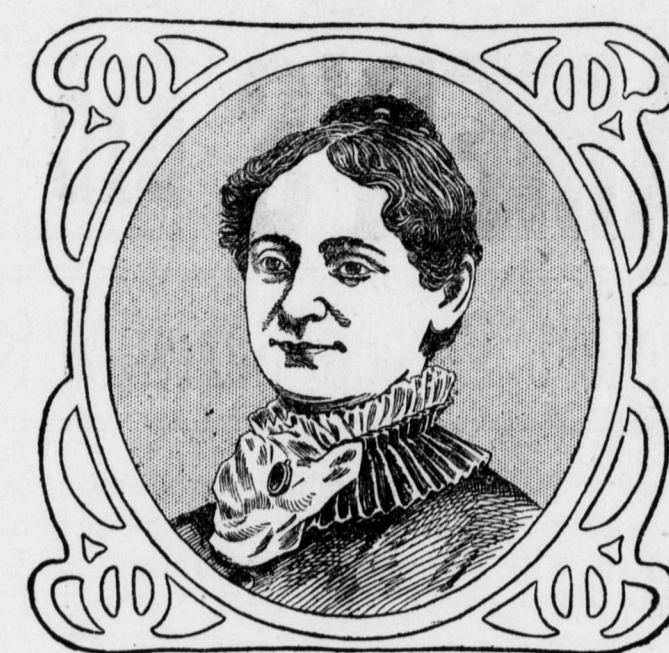
LYDIA E. PINKHAM

Of Lydia E. Pinkham's Vegetable Compound, the Great Woman's Remedy for Woman's Ills.