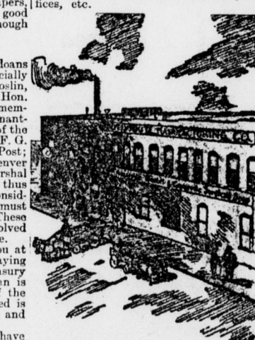
Original "Geyserte" Soap Factory Owned by the Co., Present Capacity 20,000 Cakes Daily.

to-day it is costing 35 cents; if you delay still longer it will cost you 50 cents. BUY IT NOW. Not a Probability But a Reality. Don't confuse this with a hole-in-the-ground that may not contain the metal you are looking for, nor with an oil well that may never spout oil beyond its surface. These are probabilities; Geyserte Soap is a reality. It exists. It is being manufactured, sold and used. It is no gamble or speculation. You can see it made, you can see it sold in the large stores of your city, you can see it used in households, offices, etc.