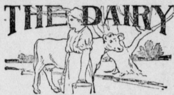
A COW WITH A RECORD.

All druggists sell Dr. Williams' Pink Pills, or they will be sent by mail postpaid, on receipt of price, 50 cents per box, six boxes for $2.50, by the Dr. Williams' Medicine Co., Schenectady, N.Y.