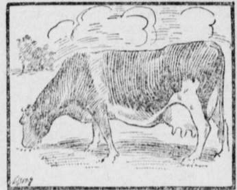
Guernsey Cow, Glenwood Girl VI.

In every dairy herd there is usually some cow that is a great deal better