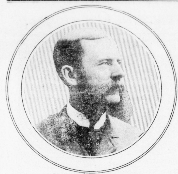
CAPT. CHAS. F. BARCLAY, Republican Candidate for Congress

dist Church and Emporium Baptist Church.