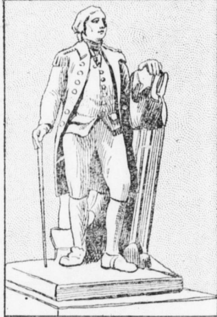
HOUDON'S STATUE OF WASHINGTON. MODELED FROM LIFE.

This was the replacing of that priceless art treasure—Houdon's famous statue of Gen. Washington—in the