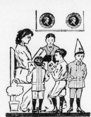
Half the boys within school gates wear Mr. Jane Hopking Boy-Proof Clother

THERE'S nothing that produces such sweet strains as Price and Quality--they're music to the ear.