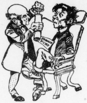
"TAKING HIS MEALS OUT."

Hurried eating has ruined many a man's stomach. The digestion-destroying process is gradual, often unnoticed at first. But it is only a short time until the liver balks, the digestive organs give way, and almost countless ills assail the man who endeavors to economize time at the expense of his health.