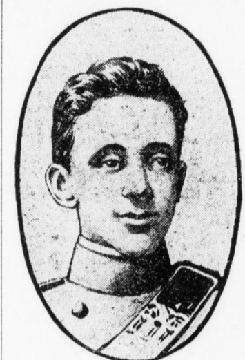
KING ALPHONSO OF SPAIN. (He Declares He Will Not Marry Before He Is 21 Years Old.)

Madrid.—Too many proposals of marriage made to the young king have so disgusted him that he now declares he will not marry before he is 21 years old. The ministers of the kingdom were the first to suggest the advisability of an early marriage to the king, and because of the advantages resulting from a closer alliance with the royal family of England they selected one of the duke of Connaught's daughters.