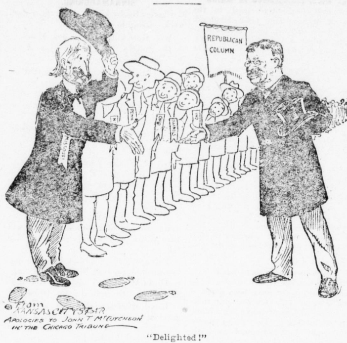
ROOSEVELT'S ST. LOUIS TRIP. ENTHUSIASTIC GREETINGS GIVEN HIM ALONG LINE OF JOURNEY. VERY FEW SPEECHES WERE MADE.

A Live Coon Was Presented to President Roosevelt at Denison, O.—Every Precaution Will be Taken to Protect Him