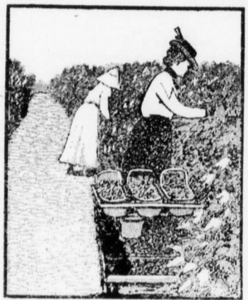
IN THE VINEYARDS.

Little by little women are entering into the outside work of the farm, doing more than merely look after the chickens and other barnyard fowls. The growth of state agricultural schools is teaching the girl as well as the boy something of the science of agriculture.