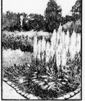
WHERE WOMEN FIND CONGENIAL OCCUPATION.

Horticulture and floriculture is a work in which women find congenial occupation.