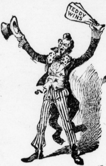
Elk county gives 926 majority for Roosevelt and Fairbanks.