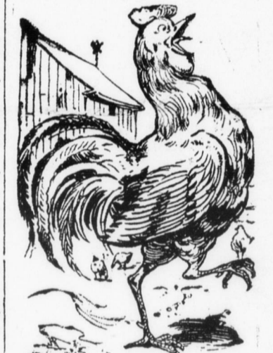
824 majority for President Roosevelt is the largest vote ever given a candidate in this county, who had opposition.

The Course is the best, not an inferior number and the nominal price, $1.50, places it within the reach of all.