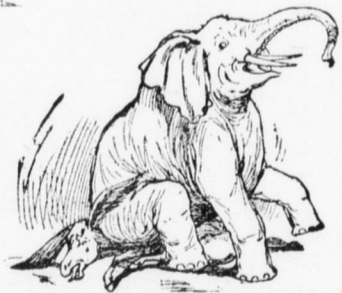
If it wasn't for that elephant that jackass could get up.