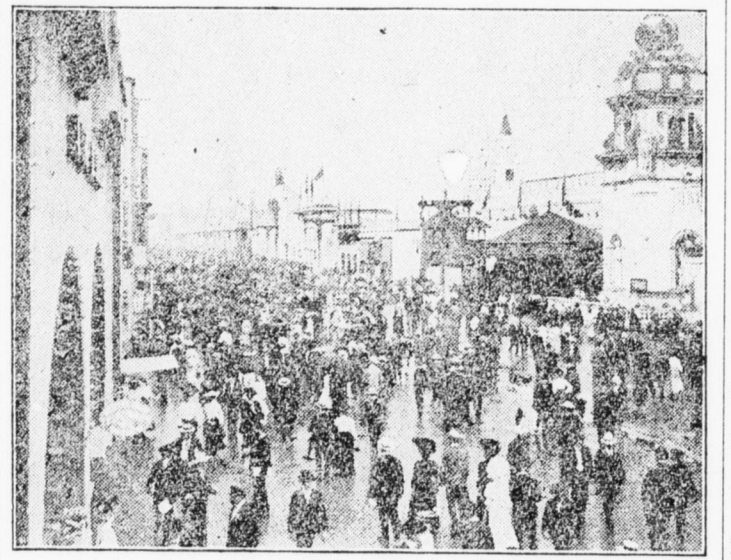
AN AVERAGE CROWD ON THE "PIKE" AT THE WORLD'S FAIR

St. Louis .-- I was standing on the their coast that such battleships guard, Plaza St. Louis, admiring the scene and the battleships are theirs. And that stretched away into the distance it is a semi-proprletary satisfaction before me, ending with the magnificent spectacle of the Cascades. I needed no ure that any American evinces in gazcompany, for the great exposition all ing at the processes or results of the around me was sufficient, but as I stood many government activities he sees exthere an acquaintance, the president of a western college, stopped beside me. ploited here. A visitor will observe a hundred interesting novelties; he will leave the building—only to go back later for another look—round-eyed